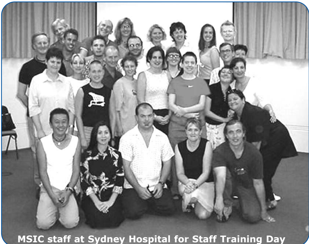
MSIC staff at Sydney Hospital for Staff Training Day